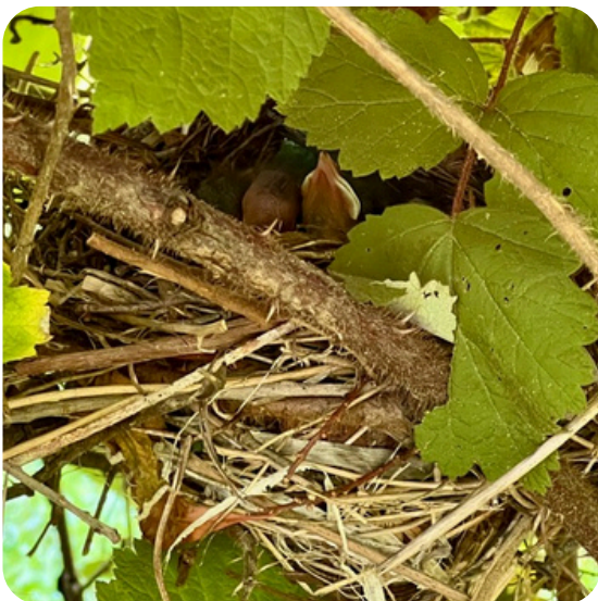
Do you see the 3 chicks? This catbird nest was found in a wineberry bush!

As always, I want to give a big thank you to our students and parents for your ongoing support. I will try my best not to send your children home in the car with low tide stench! I also wanted to extend a special thank you to our graduating class of 2025! Congratulations on all you've accomplished and thank you for your efforts and commitment to the Nature Initiative group! Wishing you all the best on this next step of your journey. You will be missed! Keep in touch and stop by on the trails, see you out there!