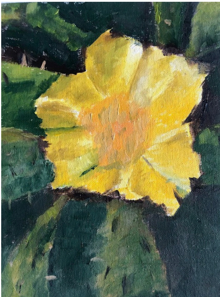
PRICKLY PEAR BY JONAH BOERBOOM